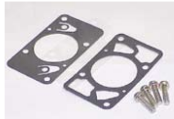
Figure #5 – Shows parts included in single or rectangular pump rebuild kit. Be sure to avoid inferior gasket and diaphragm kits from foreign sources by making sure the parts are genuine Mikuni.

Selecting The Right Pump: The rectangular pump while the simplest should only be used for single Carb applications. The Round or dual pump is internally more sophisticated and will push the larger volumes needed to supply two Carbs. The round pump can be used on a single Carb by routing the two outlet ports back together or plugging a port off. The ports exit a common chamber so how you do it makes little difference.