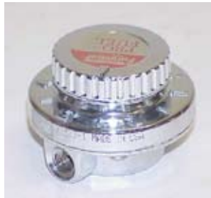
Figure #9 – A fuel pressure regulator is essential when installing a redundant system. This particular regulator can be dialed from 1 to 5 psi.

Redundant Fuel Pumps: A number of pilots have chosen the time honored system of redundant fuel pumps. There is nothing to say you can't run both impulse and electric pumps on the same system. Way back in Part #41 we stated that a parallel system was the preferred method. Since then I have got a lot of feedback that a redundant system set up in series works every bit as well. The fact of the matter is that either parallel or series system will work fine when setting up a dual pumps. If you go parallel, tee the fuel line out before the pumps and back together immediately after the pumps. Because all pumps (and squeeze bulbs) have check valves for one-way action, a recirculation of fuel is not possible. The electric motor should be fitted with a panel switch to allow the operator to prime the Carb and to shut the pump down when not necessary. If the pressure of this dual system is too great the Carb overflow vents will signal this immediately. What you are looking for is a fuel pressure from 3 psi to 5 psi at the carburetor. If the system continues to deliver too much pressure, a pressure regulator is the proper solution. If you choose to go in series, mount the electric as close to the fuel source as possible followed by a fuel pressure regulator and then the pulse pump.