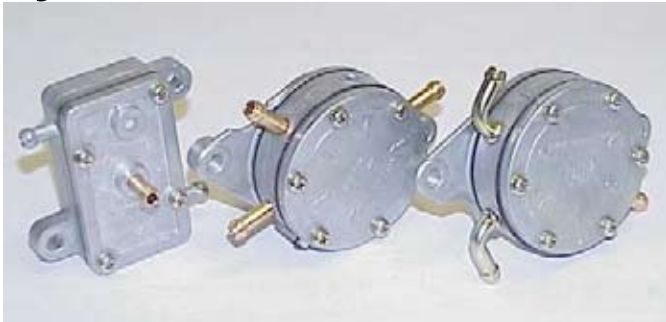
Figure #1 – Mikuni /fuel Pumps are available in three different types. The round pump is available in two configurations with the only difference being the outlet ports as shown at left.

At the risk of stating the obvious, constant and reliable fuel delivery is absolutely essential for engine reliability. Yet often times we take the fuel pumping system for granted figuring if it works OK just leave it alone. The pulse pump while incredibly simple must be maintained properly to assure continued reliability. This month we'll look at pulse activated fuel pumps, how they work, how to set up a new system, how to inspect and rebuild the most common pumps, plus we'll look at how to set-up a reliable low cost redundant fuel delivery system.