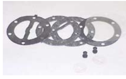
Figure #7 – The dual pump rebuild kit includes four gaskets, a clear diaphragm, and a pair of disc valves as shown.

Mikuni Dual Round Pump: Prepare a work area as described above. The pump has three separate aluminum sections. Mark them with a felt pen or scribe line so you can reassemble the pump with all ports pointed the same direction as when you started. Remove the rack of six screws and remove the top plate only. Remove the gaskets and lay out in order they are removed. Note that one gasket is a thick paper gasket and one is a thin rubber gasket. Note the indicator tab on both gaskets that line up with the tab on the exterior of the top cover. Remove the center body, diaphragm, and gaskets from the base of the pump body. Again lay them out in the order they were removed. Using a small diameter rod push both rubber keepers out of the valve body and remove the round clear plastic valves. Take a minute to look at these valves and how they function. They are a bit more sophisticated in design than the flapper valves found in the rectangular pumps but still made of the same clear material. Also note that the outlet ports come from a common chamber, so plugging one off or routing them back together for use on a single Carb application makes little difference.