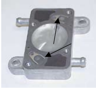
Figure #6 – Rectangular pumps use a pair of flapper valves that are nothing more than a ¼" wide flap of clear plastic material to create a one way flow. Insanely simple !!