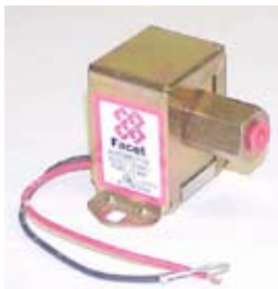
Figure #8 – The right size 12 volt electric pump can be a wise addition to any fuel system when properly installed.

Electric Fuel Pumps: A lot of operators like the ideal of an electric 12-volt DC fuel pump. Starting is easier because the Carb float bowl can be filled before grinding the starter. Facet makes a compact little solid-state unit that does an excellent job of delivering about 5 psi to the Carb. See figure #8. Unfortunately these pumps are sealed and are not rebuildable.