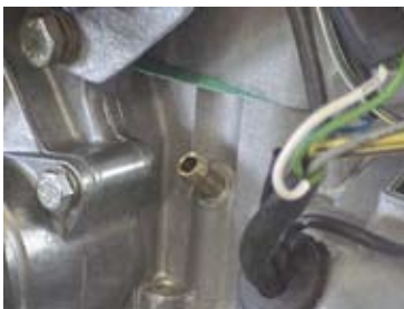
Figure #2 – The engine pulse port is located next to Carbs. This port accesses the engines lower end where a high/low pressure is created the piston travel.

How Does A Pulse Pump Work: Whether a single rectangular Mikuni Fuel Pump or the round dual outlet Mikuni type the system works much the same. The bottom end of the engine crankcase is continuously subject to a high/low pressure with every stroke of the piston. This pulse is transferred to the fuel pump by means of a pulse tube. The pulse line connects to the pulse chamber on the fuel pump. The high pressure/low pressure pulse of the crankcase pushes fuel passed a pair of one-way valves on either side of the chamber and out the outlet port. Real uncomplicated stuff, the essence of simplicity. Yet you have to realize that the system does have limitations as far as expected fuel pressure and the distance up hill the fuel can be expected to rise. A vertical rise of no more than 39" can be accepted out of any pulse pump. Anything higher and count on deliver problems. Another thing to remember is that the pulse pump is always limited to the pressures or pumping value of the crankcase. With a pulse pump it is nearly impossible to create too much pressure for the Carb float level. Also keep in mind that the fuel pressure available will fall off as the crank seals and gaskets being to leak over time.