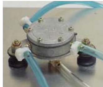
Figure #3 – When mounting a fuel pump vibration isolation is a prime concern. Here a dual pump is mounted on two #260-657 Rotax Radiator mounts. This also puts the weep hole at the bottom point where it belongs.

Fuel Pump Mounting: Several issues must be addressed when mounting the fuel pump. First of prime concern is the distance from the crankcase pulse port. A line longer than 19" will likely dampen the pulse to a point where the pump efficiency can be greatly reduced. The rule here is to use the shortest practical line. The pulse line must be rigid enough not to allow the pulse to be dampened by a flexing tube wall. Fuel pumps should never be mounted directly to the engine where excess vibration may affect fuel flow. Vibration isolators are often used to give the pump a firm yet flexible mount. Mounting the pump higher than the engine pulse port is recommended. This will make it difficult for any fuel from the crankcase to reach the pump chamber. If not possible run the pulse line uphill a short length to form a "trap" for any fuel that might transfer from the crankcase. Remember the two things that are going to kill the pump the quickest is heat and vibration. If the ports on the dual pump do not match your particular set-up remember that the inlet and outlet ports can be rotated in relation to the mounted ears by removing the rack of screws and relocating the top portion of the pump.