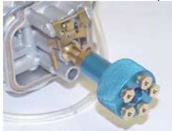
Figure #5 – The Bing Quick Change Wrench has both 8mm and 10mm hexes for both the main jet and the needle jet. The newer version has handy threaded ports for the storage of additional mains for seasonal jetting changes.

With a magnifying glass study the rubber tip of the valve and the internal seat for wear. This piece controls the fuel entry and the float level in the Carb. If not seating or closing properly the fuel will continue to flow causing the fuel to exit the overflow or vent tubes on either side of the Carb. A messy if not dangerous situation. The seat or internal brass cylinder is considered part of the main Carb body and non-replaceable. I understand that Bing does make a replacement kit for this item but the procedure is extremely difficult and not recommended for a novice or the faint of heart. Remove idler jet and inspect for blockage. Note the number stamped on the side. (40, 45, 50, etc.) Check the recommended chart found in the CPS catalog to see if this is the right number. Rarely should this part vary from the recommendation. Use a blast of compressed air in both directions to clear jet passages.