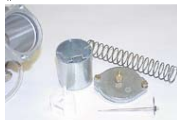
Figure #6 – The top end parts are accessed by removing the two screws on the Carb top plate.

Remove Needle Jet: Next remove the needle jet and main jet using a 8mm and 10mm open end wrenches or use the #6926 Bing Quick Change Wrench shown the figure #5. One end is 8mm for the main jet and the other end is 10mm for the needle jet. The unit shown here also has storage for additional main jets. Drop the needle jet out of the passage. Use a magnifying glass to inspect both jets for wear or blockage. Use a blast of compressed air in both directions to clear jet passages. Replace at the first sign of wear. Note the tuning number on the needle jet. (2.70, 2.72, 2.74, etc.) Check to see if it matches the recommendation in the jetting chart. This part along with the needle riding in from the top of the Carb controls mid-range throttle response. It is generally recommended to change the needle