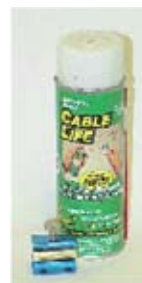
Figure #8 – The use of the Cable Luber Kit shown here allows lube to be forced into choke and throttle cables while they are still in place. Special clamping block and snorkel kit sells for less than $20.

Carb Top Entry: How the cable enters the top of the Carb is extremely important and often times overlooked. The standard #260-370 Rubber Grommet (center of Figure #9) is fine for keeping out dirt but does little to keep the cable from riding up onto the collar of the adjustor nut especially if slack is present in the line. This can cause the throttle to stick open and create a dangerous situation. A piece of #7011 ¼" i.d. fuel line and a couple of clamps works well to supply strain relief and flexibility yet security when applied to throttle lines as shown in figure #9.