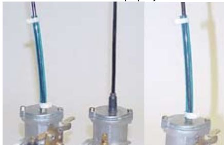
Figure #9 – Special attention needs to be given to the Carb top entry. The use of a short length of ¼" i.d. fuel line makes and excellent strain reliever.

You can lube the lines in place with the use of a "Cable Luber Kit" made by Champions Choice, Inc. A special block can be clamped over the end of any choke or throttle line and attached to the aerosol can with a snorkel tube. This can be done without removing the line from the installation. All you need is a little slack to fit the block on the cable end. When properly installed the Luber will force fluid through the entire cable with a minimum of mess. See Figure #8.