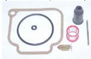
Figure #1 – Bing Carb Rebuild kit #13503 contains most everything you need to do the job for less than $30.

One of the most overlooked and misunderstood parts of the powerplant is the Bing Model 54 Carb. While a lot of guys follow the Scheduled Maintenance plan religiously and need to be commended for it, many do not really understand what to do every 50 hours when the plan calls for "Clean Carburetors and check for wear". The same round slide Carb is used on all two stroke engines from the 277 to the 618, the only difference being the jetting found in the recommending jetting chart. This month we'll discuss the things to look for when maintaining your Carbs, the parts you need to have on hand before you get started, and why using oil injection instead of premix actually will considerably extend Carb life.