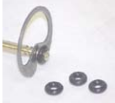
Figure #7 – Pay particular attention to the relationship between the tuning pin and the e-clip. These two parts will rotate and wear from vibration. The small o-ring shown here provides enough interference to stop this wear.

After a thorough inspection, reassemble the top of the Carb paying close attention that the e-clip is below the spring cup. Yes, it fits nicely inside the spring cup but this will cause an over rich mid-range. Years ago I had a guy call me from Ireland complaining that his buddies had worked on his carburetors and now his fuel consumption was nearly doubled. After listening to his heavy Irish accent for a while, I suggested he inspect his carburetors to see if the e-clip was on top the spring cup. A few days later he phoned to say everything was back to normal and that his buddies weren't going to get near his plane anymore.