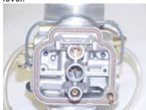
Figure #3 – With the float arm removed you can now inspect the passages including the inlet seat and jet passages.

Checking Float Level: If you suspect fuel delivery problems inside the Carb first check the float level. With the engine running normally kill the engine and turn off the fuel valve at the same time. Flip the bail and drop the float bowl carefully. Remove the floats and measure the fuel level. The correct level is \frac{1}{2} " from the top of float bowl. Don't start bending the float arms to change the level. Rather inspect the parts carefully for wear or float saturation. Check the float arm #861-190 for wear or flat spots at the contact point with the float. To check the alignment measure from the surface of the float bowl gasket to the float arm at the contact point. Should be right at 10.5 mm or 0.412". Only after verifying that all parts are working properly, adjust the tab at the contact point of the valve to achieve proper float level.