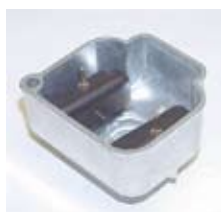
Figure #2 – The float level should be \frac{1}{2} " or about 13mm from the top of the bowl with the floats removed.

Getting Started: General overhaul should be done at the same time as the engine or at the recommended 300 hours. Have on hand a Bing Carb Rebuild kit shown in Figure #1. Available for less than $30, it includes all the normal parts you replace including the 261-705 Valve w/ viton tip that sells for more than the entire kit when purchased separately by part number. Be sure to order one per Carb.